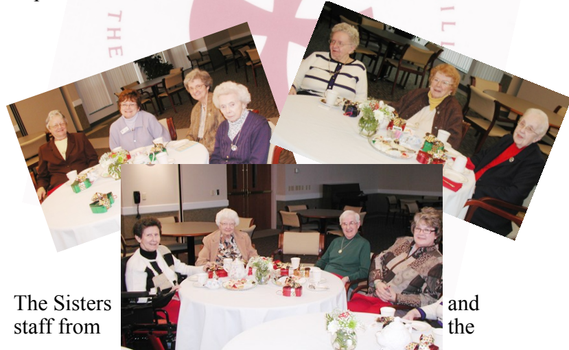
The Sisters and the staff from