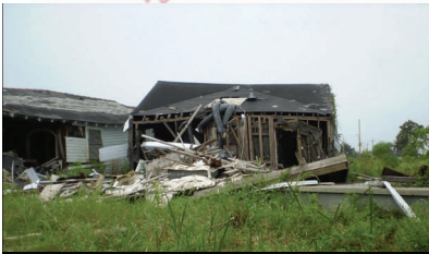
9th Ward, New Orleans